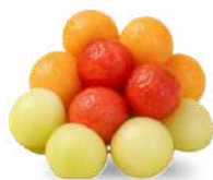
Melon Balls Trio