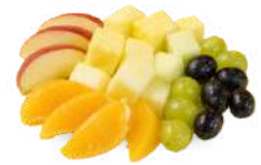
Standard Fruit Salad