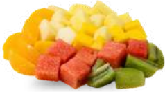
Exotic Fruit Salad