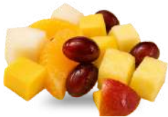
Tropical Fruit Salad